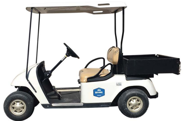
2 PASSENGER / BOX CARTS