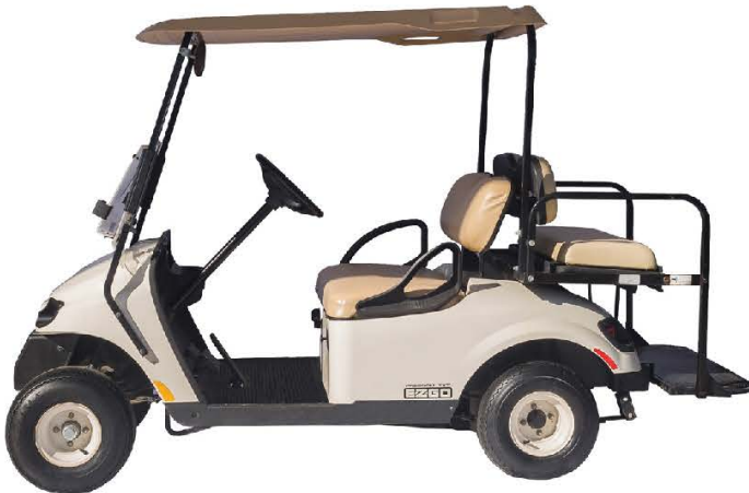
4 PASSENGER CARTS